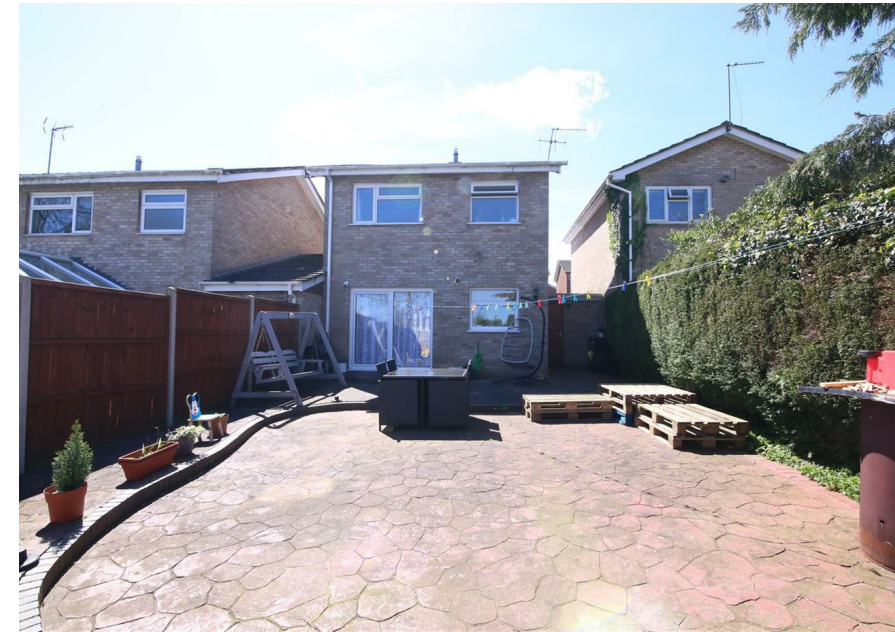
Energy Efficiency Rating